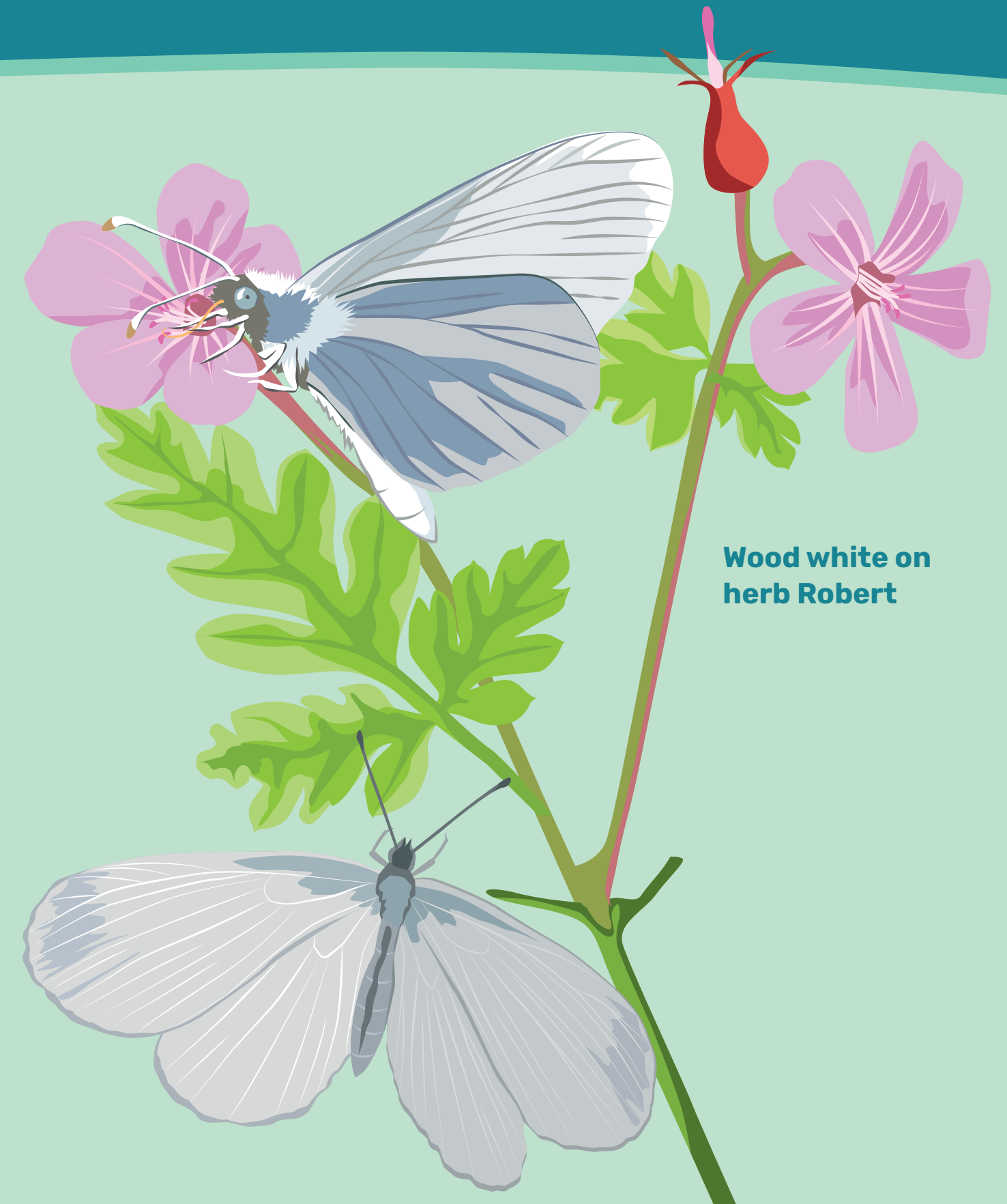
Wood white on herb Robert

We couldn't work to protect and conserve Worcestershire's fantastic wildlife and wild places without your help. Please support us by becoming a member, volunteering or donating.