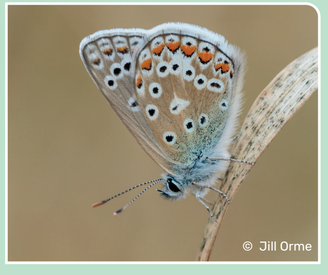
Summer: common blue, bird's-foot trefoil, common whitethroat, lesser whitethroat, cuckoo