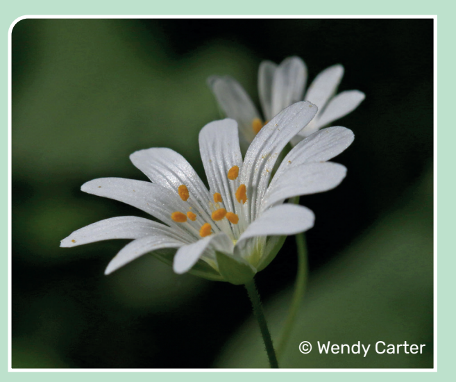
Spring: orange tip, cowslip, hawthorn blossom, greater stitchwort, green woodpecker