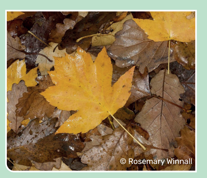
Autumn: quelder rose berry, rosehip, wild service leaf