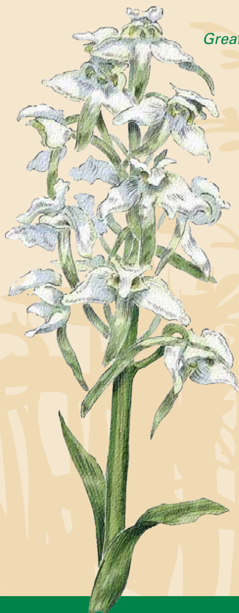
Greater butterfly orchid