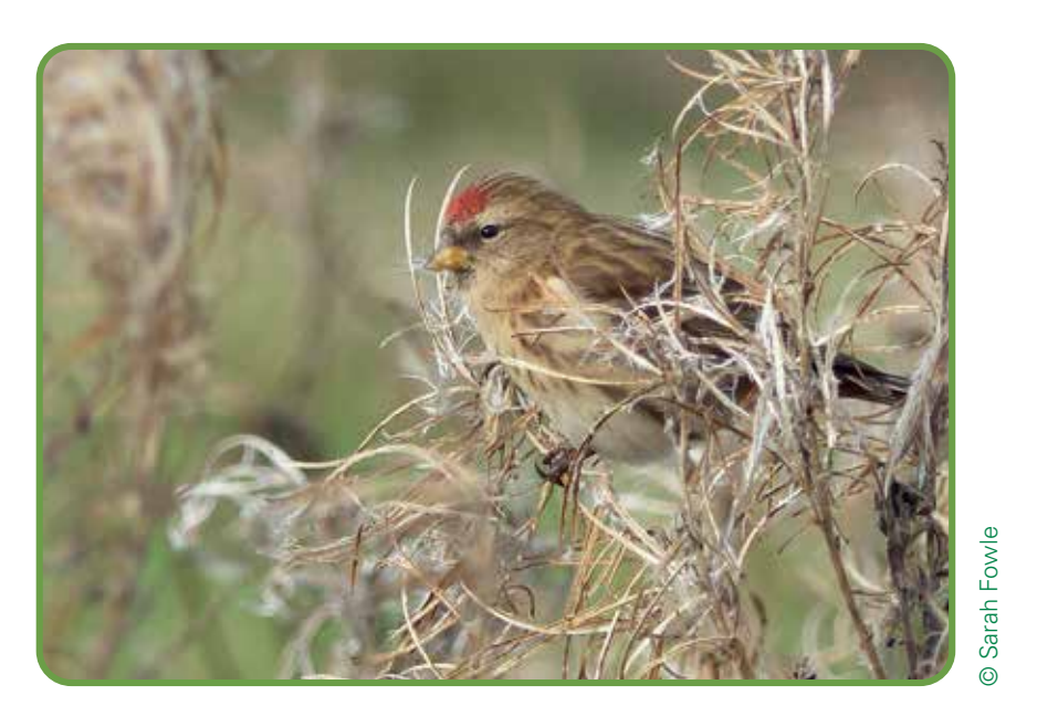
WINTER - redwing, rosehips, nuthatch, silver birch, redpoll