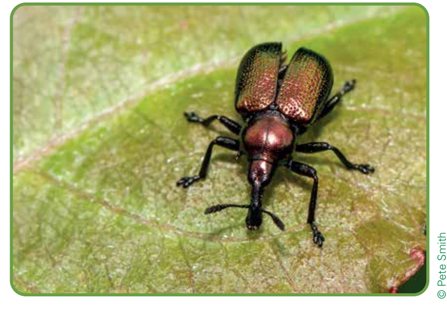
SPRING - brown hare, aspen leaf-rolling weevil, dog's mercury, brimstone, blackcap, broad-bodied chaser, bird's-foot trefoil