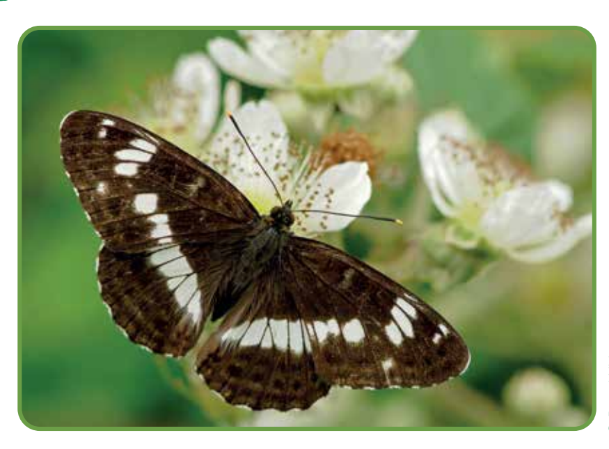
SUMMER – common spotted orchid, knapweed, white admiral, silver-washed fritillary, brown hairstreak, garden warbler, meadow saffron