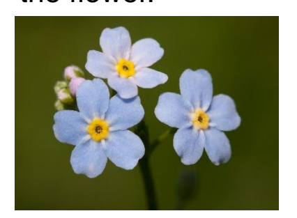
Forget-me-not These come out in early

Bees will be looking for flowers with lots of nectar for them to drink to give them energy. They will also need pollen for their bee babies. Bees are guided to these flowers by scent and the patterns on the flower.