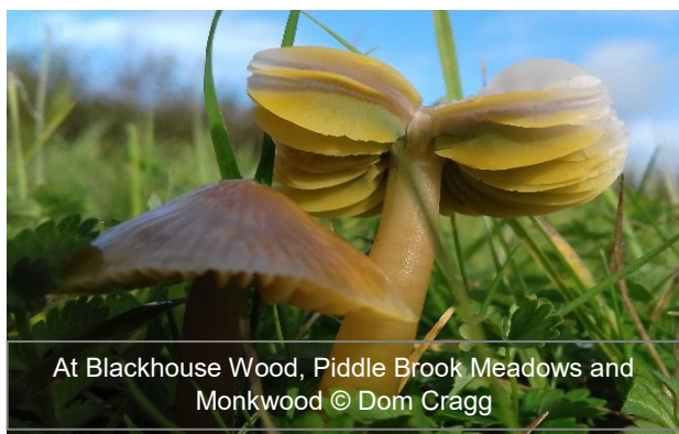
At Blackhouse Wood, Piddle Brook Meadows and Monkwood