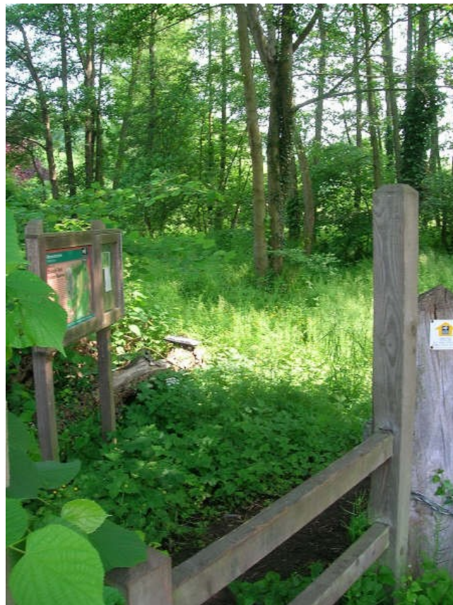
Bishop's Field, entrance

The pools that are now insignificant were once used by villagers for boating. The channel where marsh marigold thrive is a former channel of Stour. The original name of the main marsh is Butcher's Field – animals were kept on here before slaughter and, yep, there was a butchers in the village. The rare greater tussock sedge thrives on the valley peat, first formed after the ice age. ... this is just a taster!