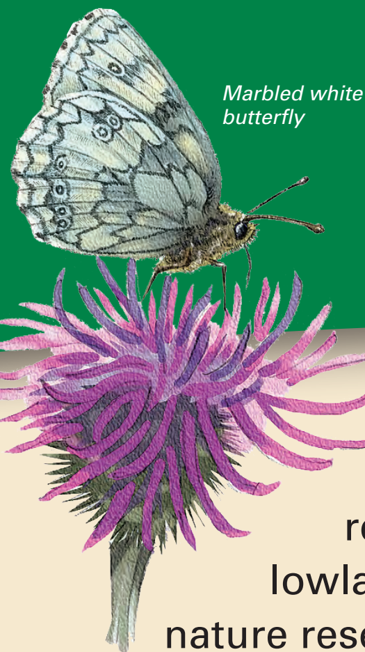
Marbled white butterfly