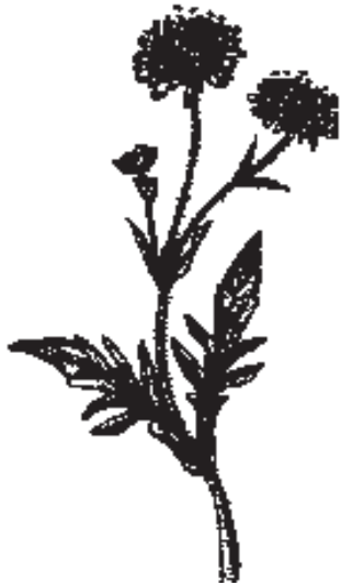
Field scabious is popular with butterflies

Key: * Good for bees + Good for butterflies - Good for insects = Good for birds \ Good for moths