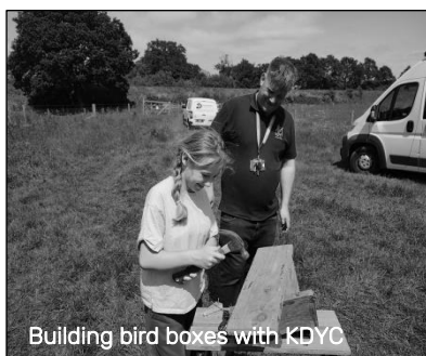
Building bird boxes with KDYC

Saving Worcestershire's Heathlands Engagement Officer