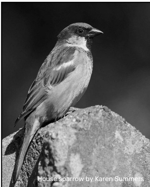
House sparrow

The Trust has teamed up with Worcestershire Biological Records Centre and the Worcestershire Recorders in order to track some of our local wildlife. How are our house sparrows doing? Have your house martins returned? Have you spotted a hummingbird hawk-moth in your garden? How do you know what to look for or how to identify what you see?