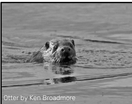
Otter

An otter swam, dived and rolled over in a river made high by recent rain. After a couple of minutes I noticed a movement on the bank and saw a second otter slither into the water.