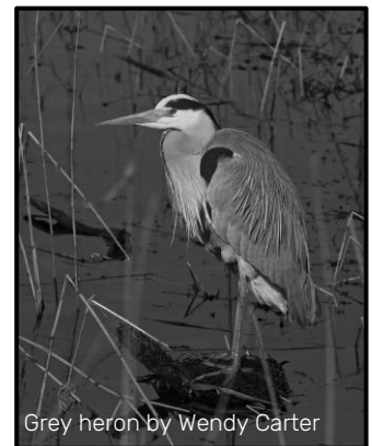
Grey heron

Upstream, where the water eddied slightly beyond a fallen tree, I saw a disturbance in the water. I assumed it was a goosander as I'd seen one or two of them here before. Instead of the familiar duck resurfacing, I was amazed to see a flank roll over and then a whiskery face!