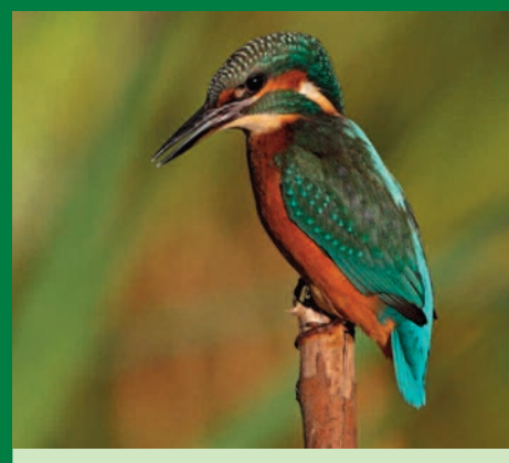
Kingfishers eat fish and aquatic insects. They are occasionally sighted along the canal and river here. They have unmistakable iridescent feathers that can appear to be bright blue or green.

Meadowsweet is a white flowering plant found each summer in the areas of wet grassland along the River Salwarpe. It is strong smelling and in medieval times was used to scent pillows.