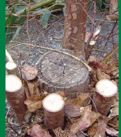
Coppicing is a traditional method of managing trees by cutting down young stems to near ground level. Regularly coppiced trees will live a lot longer and the different stages of coppicing in the wood create a variety of habitats for wildlife.

Whatever the season there is always wildlife activity for you to spot as you walk through the nature reserve. Don't forget your binoculars or to bring a camera with you!